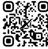
Media Safety Datasheets

Please read the safety datasheet before installing any of our water treatment systems.