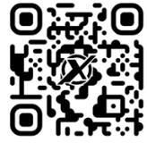
Pump Express Website